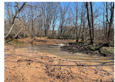
Downstream After Removal