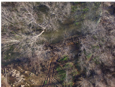
Aerial Before Removal