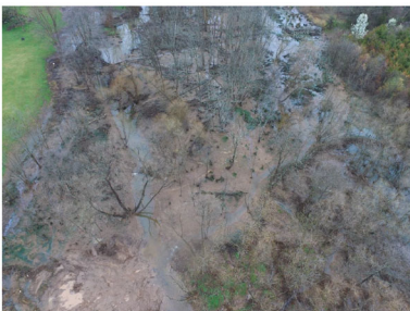
Aerial After Removal