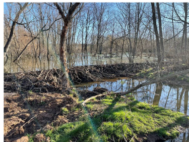
Downstream Before removal